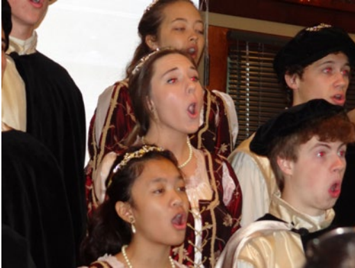
Mountain View High Madrigal Singers, at our Holiday Party