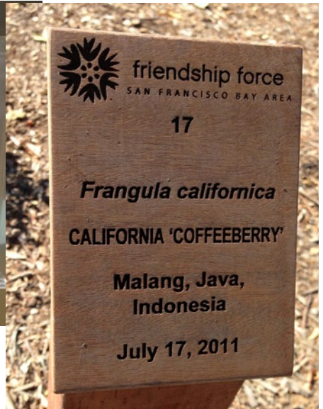
New Friendship Forest Plaques Founders' Day