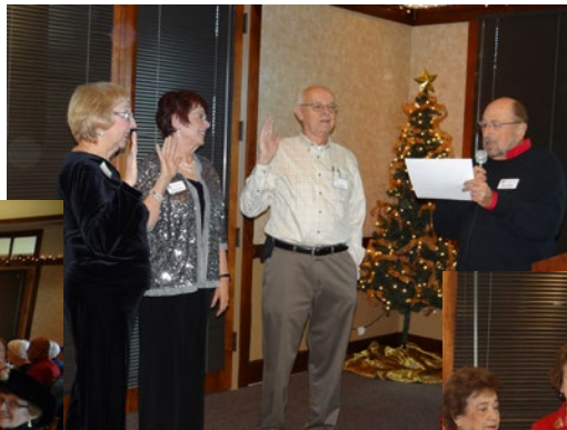
Swearing in the new Board, at our Holiday Party