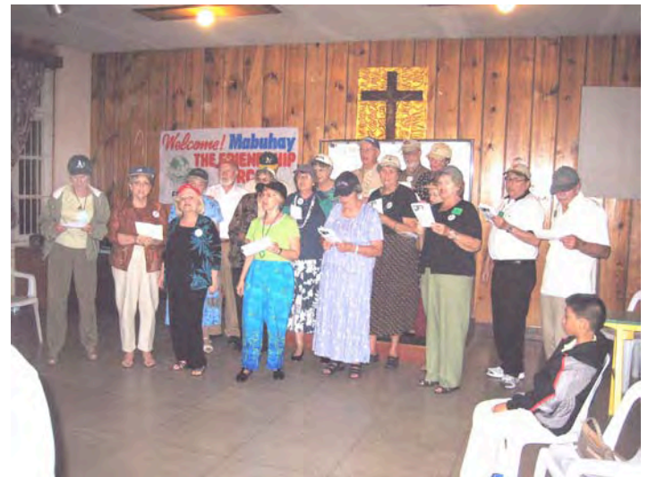
We sang our special version of “Take Me Out to the Ball Game” to our hosts in Baguio, at our farewell party.