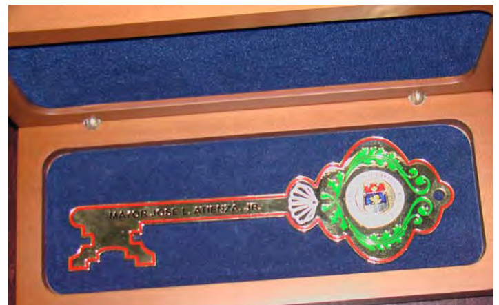
This is the key to Manila. We're not sure which gates or doors it unlocks, but the Mayor assured us it is very powerful!