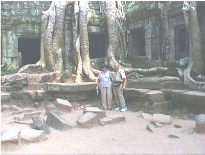
The Shannons set the scale for the massive root problems at the Bayon Temple in Cambodia.