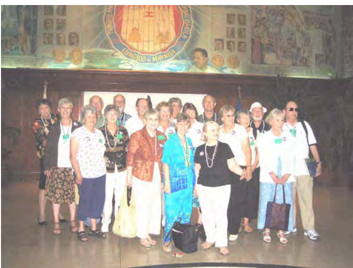
We are received in the Manila Mayor's office, following our brass band welcome!