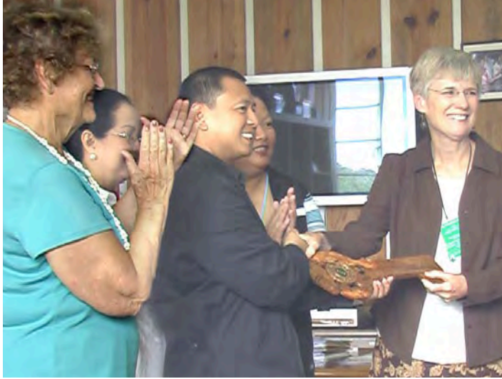
Baguio's Mayor gives us the Key to the City

audience with our American ambassador at the Embassy, and several school programs featuring the best of their student talent. Hopefully, the nightmarish traffic of the city will not be the most indelible memory. Several of our ambassadors had to endure up to two and a half hours of commuting to gather at the Philippine Women's University in the center of the city for our daily group functions. We have to admit, however, that another highlight was the whole group's being treated to a ride in a "jeepney," a hybrid take on the jeeps left behind by the Americans after World War II. These stretched out, narrow vehicles hold twenty passengers, ten on a bench on each side, paying 14 cents apiece. The religious icons adorning them eloquently express Manila drivers' fatalistic attitude.