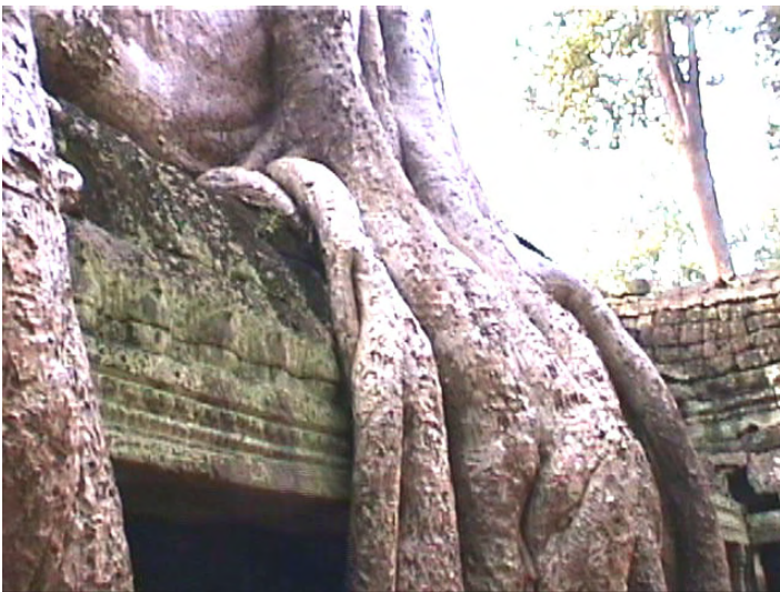
You thought you had root problems?