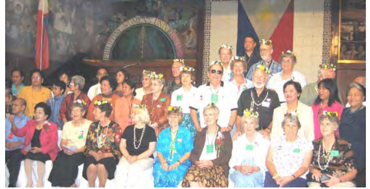
We're received at the Philippine Women's University, the hub for all our activities in Manila.

generous hospitality and their efforts to show us all the local highlights, including Burnham Park, dedicated to and named for the Chicago architect who laid out the design of the city (as well as that of many American civic centers, including San Francisco's). Of course, a visit to the Philippines isn't complete without an evening of karaoke singing! The welcome and farewell parties were down home family affairs with lots of singing and home cooked local specialties.