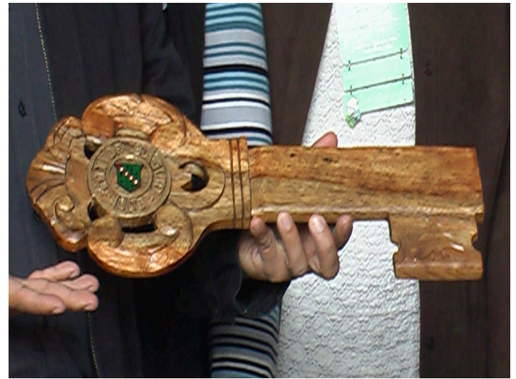
The key to Baguio is a lovely piece of wood carving!