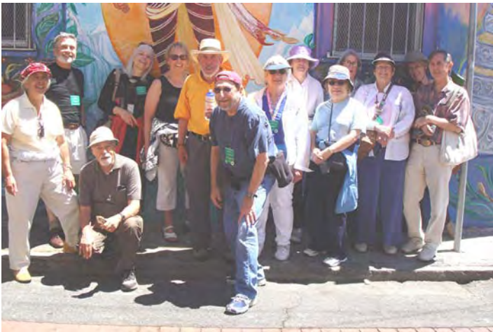
The FFSFBA group that took the San Francisco Mission District Mural Walk.