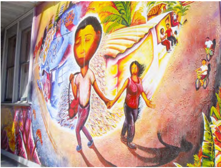
One of the many lovely murals the FFSFBA SF/North Bay Area Group saw on the San Francisco Mission District Mural Walk.