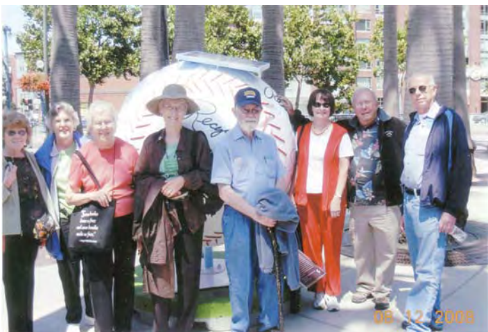
FFSFBAers tour the AT&T Ballpark.