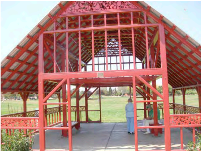
This new barn-like structure provides shade near the Friendship Forest.