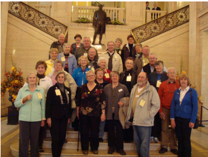
Taken at the Capitol of Northern Ireland