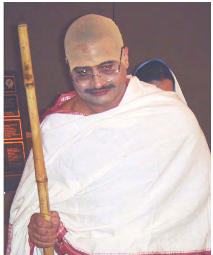
Ghandi was there too!