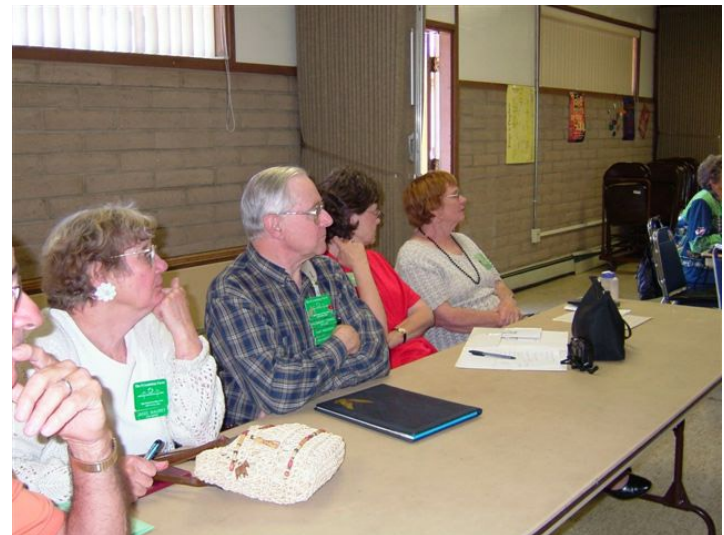
Scenes from the Western States Leadership Conference.