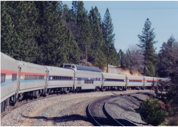
Snow Train to Reno—March 4–6, 2003. Twenty members and friends had a great time.