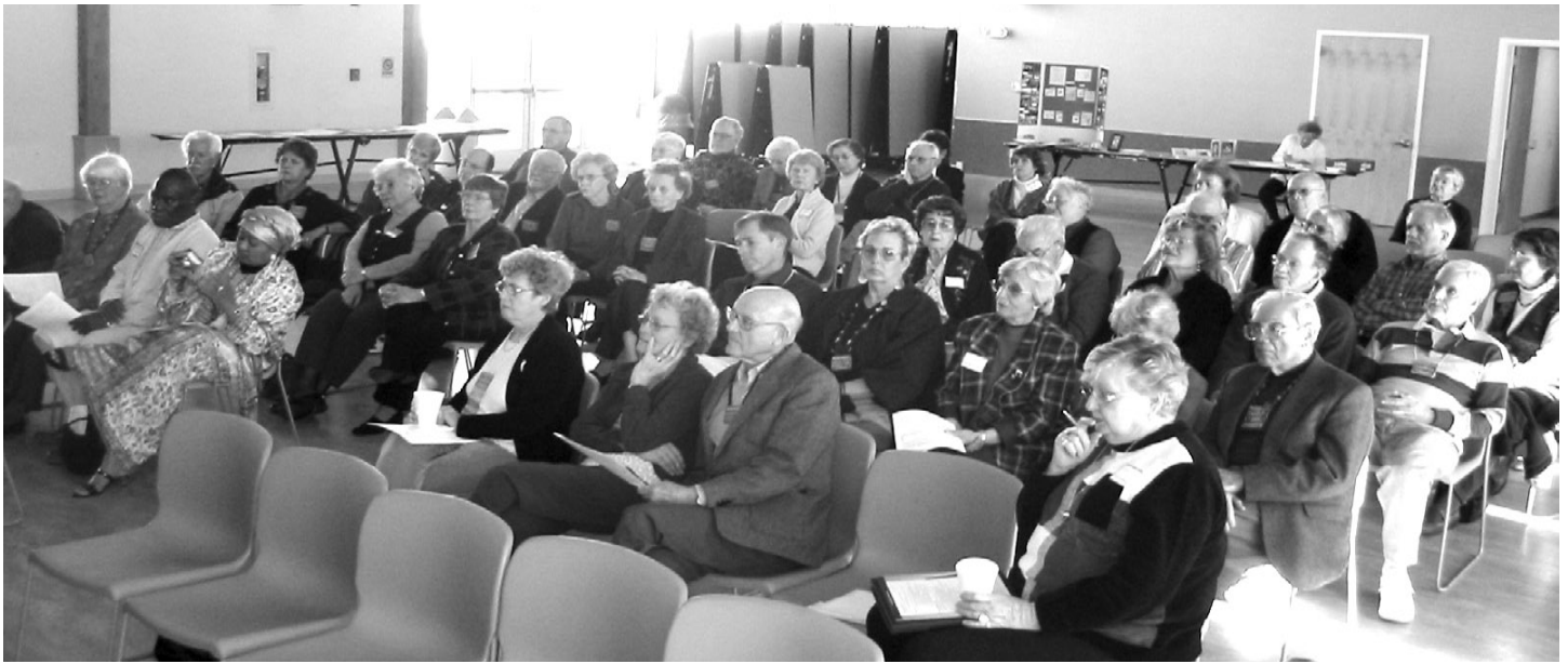
A thoughtful group at the FFSFBA general meeting February 9 at Redwood Shores.