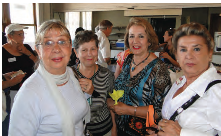
The FFSFBA Annual Picnic and Farewell Party for the Alajuela, Costa Rica, incoming exchange.