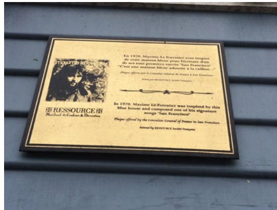
One of the French couples looked for (and found, with Google's help) this blue house, which was made famous in a 1970 song by Maxime Le Forestier. They had brought the words, and sang the song!