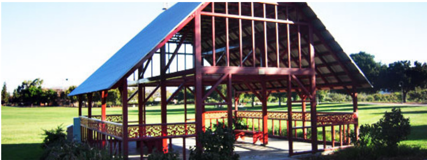
This structure is next to the entrance of the Friendship Forest area of Prusch Park.

to overlook. Perhaps we need to organize an event, such as attending one of Prusch Park's annual festivals, that will enable them to appreciate what it contributes to the Park and how it represents Friendship Force's purpose.