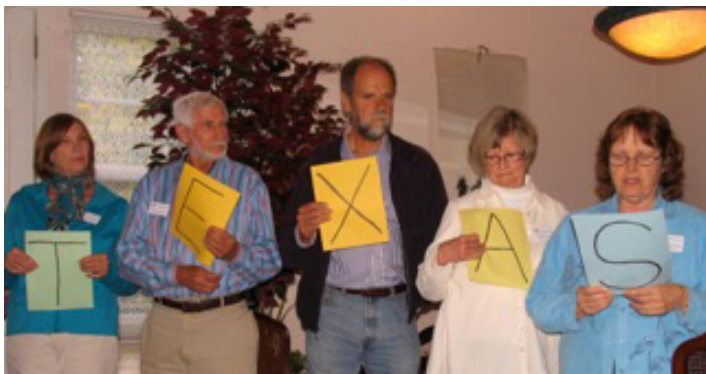
Dallas members at the Farewell Party