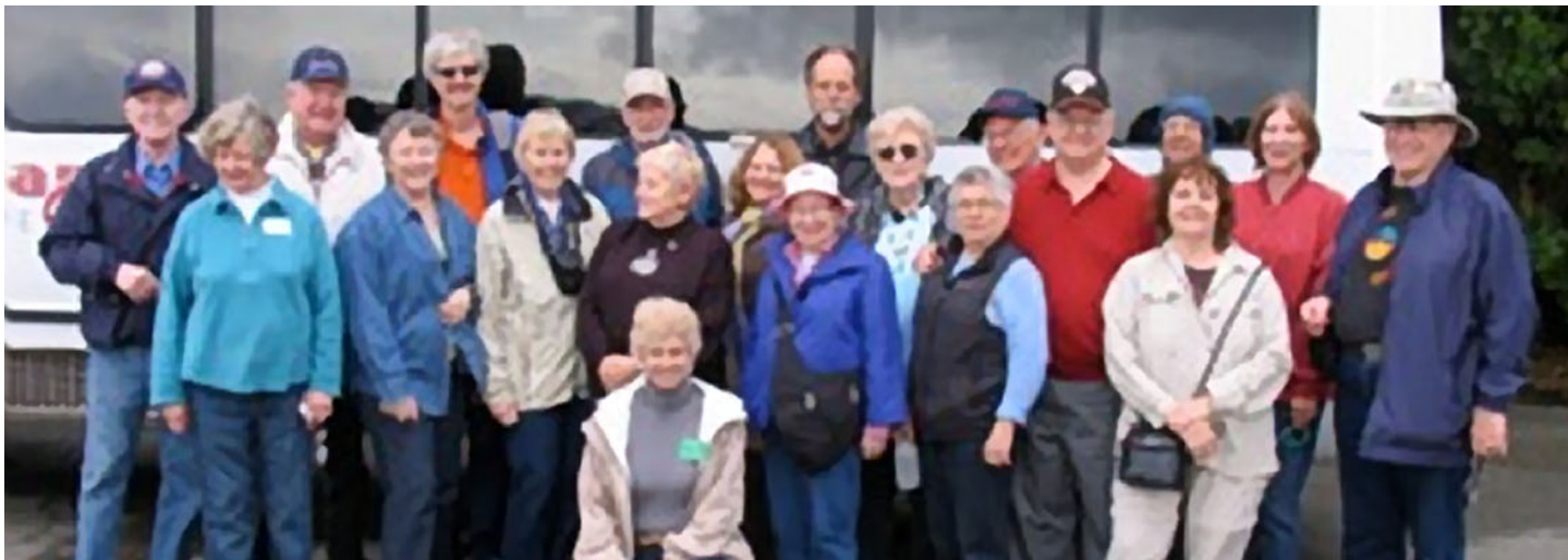
Our new Texas friends