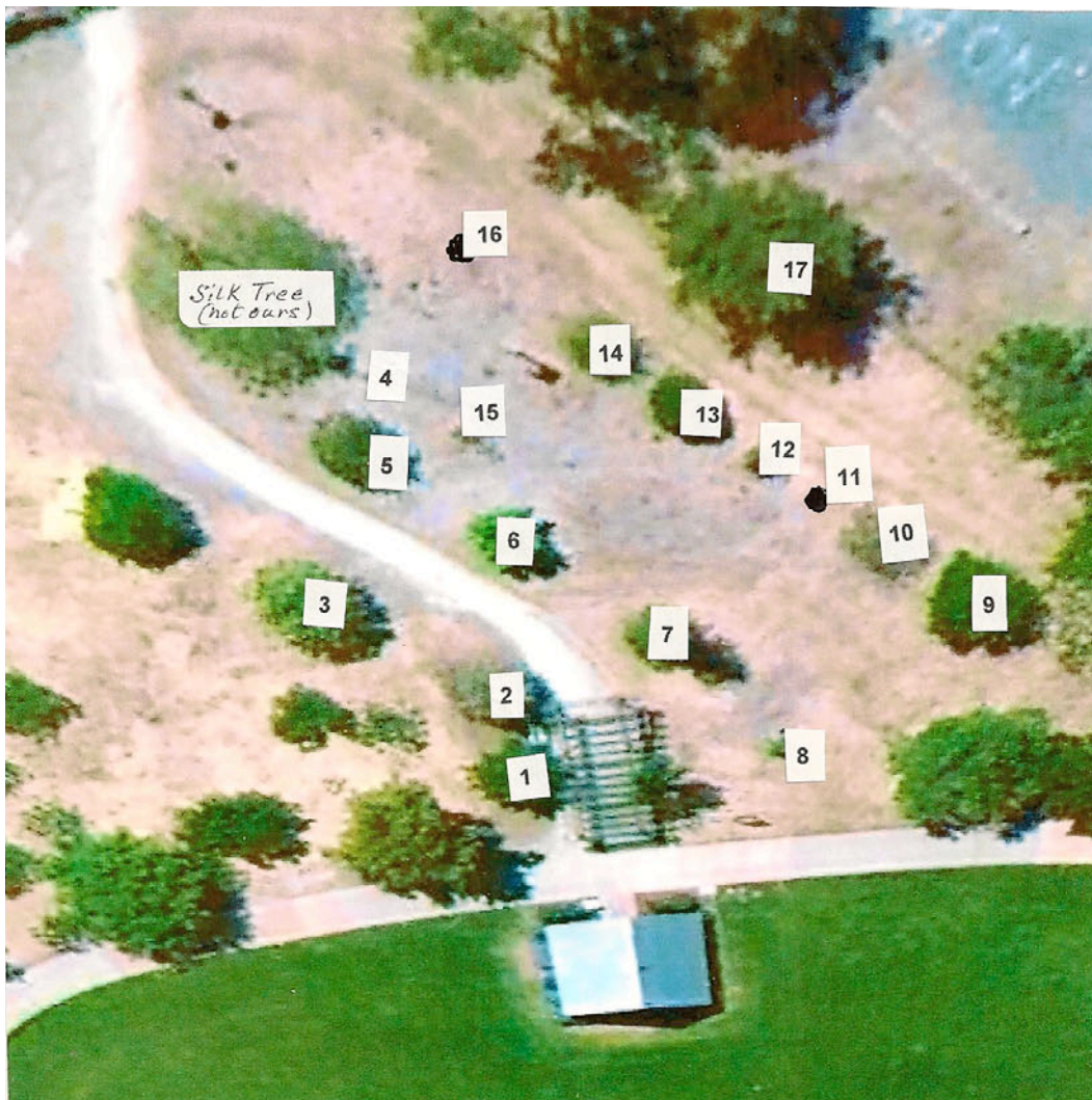
Aerial map of the Friendship Forest in Prusch Park

3. Tree choices: Consulting with OCF's knowledgeable staff, I choose drought tolerant trees that bear some relationship, at least symbolic, to the honored club. For example, because Costa Rican and Indonesian trees might not thrive in San Jose, we planted California native Coffeeberry trees for both of them. The Indonesians we hosted are from the island of Java. Get it?