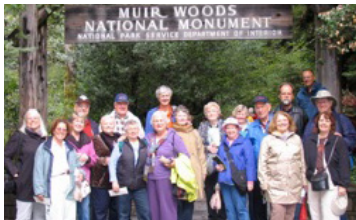
The Dallas group in Muir Woods