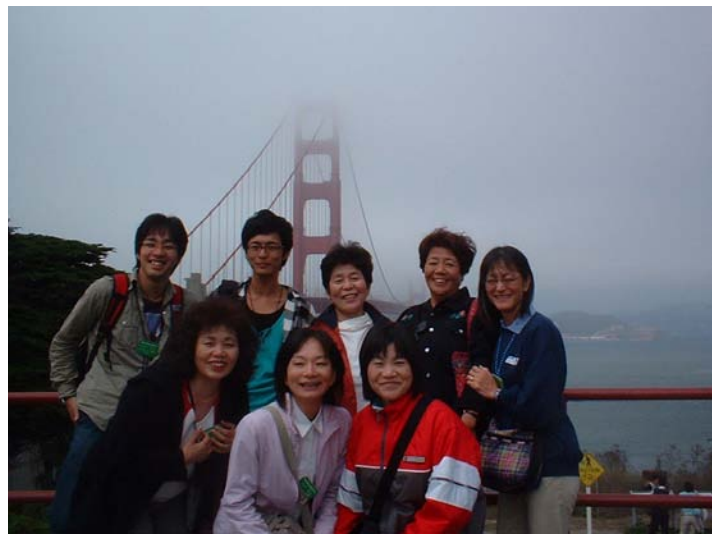
Osaka guests in front of the fog-shrouded Golden Gate Bridge.