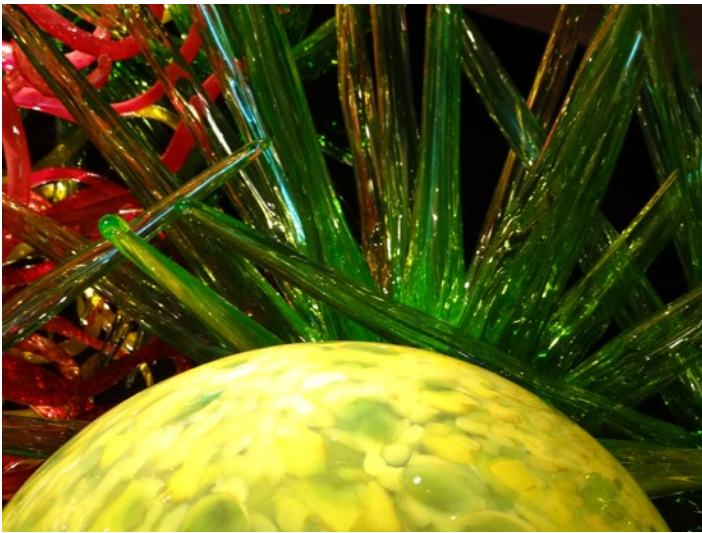
Chihuly Glass (Florida)