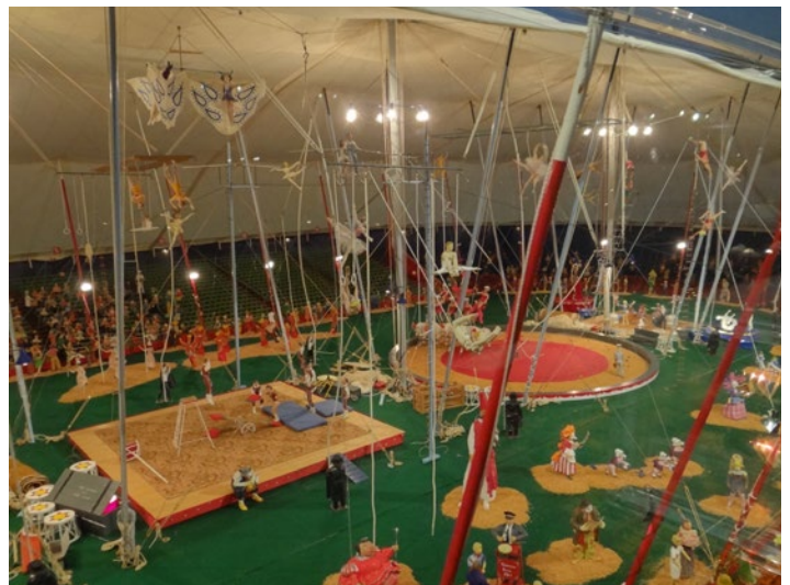
Miniature Circus (Florida)