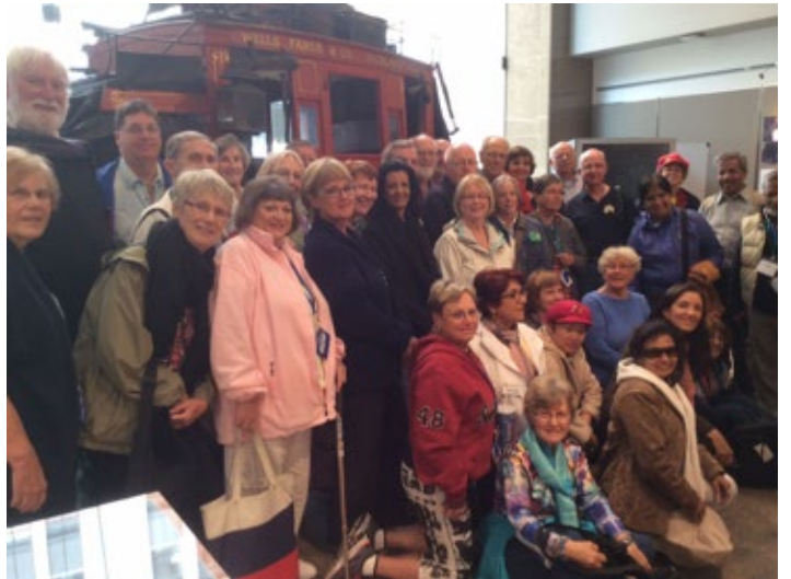
Gold Rush ambassadors and FFSFBA members at the Wells Fargo Museum