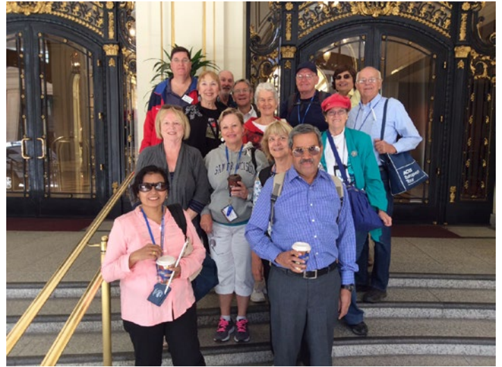
Formal entrance to the Palace Hotel. It was built around 1885. Our meeting place before Gold Rush tour, Saturday, June 14, 2014