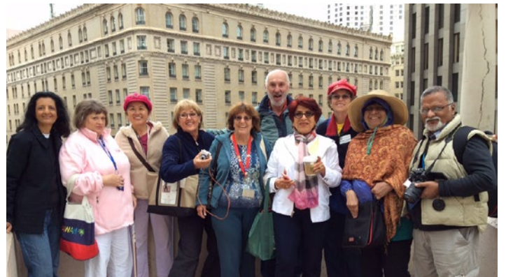
Behind us is the Palace Hotel, where we met on 6/14.