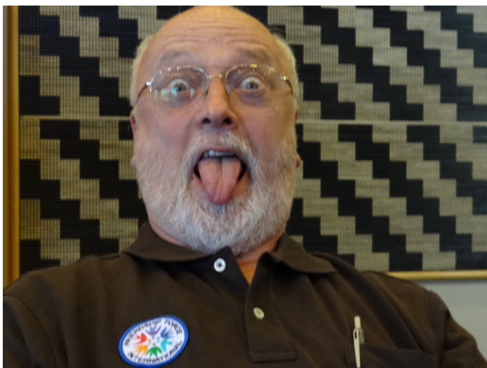
Our man practices defending our club in the Maori way.

The address of the Los Altos Library for your GPS is 13 S San Antonio Rd., Los Altos, 94024.