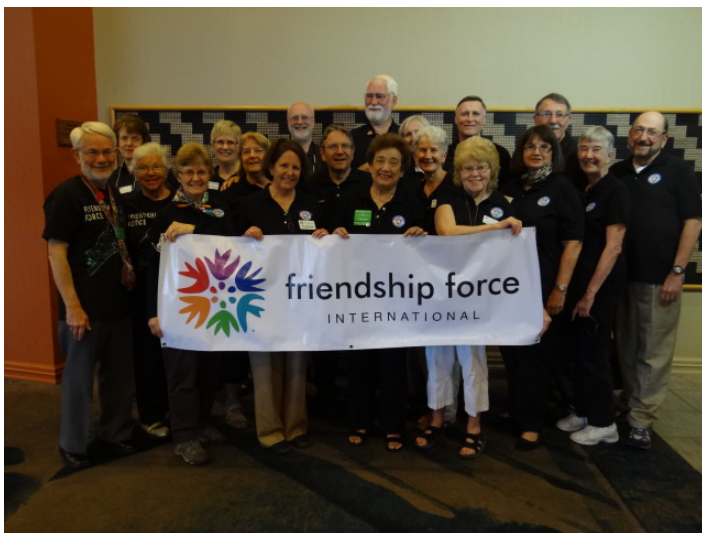
Our Ambassadors on tour in Rotorua, NZ.