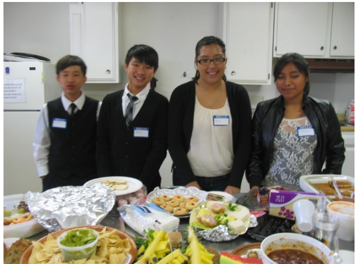
Teen volunteers from Fremont served us at our February 11 meeting.