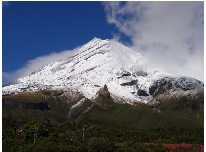
Mt. Taranaki (Mt. Egmont) near New Plymouth, New Zealand