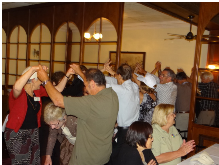
Dancing the night away at the Farewell Party in Wellington, NZ.