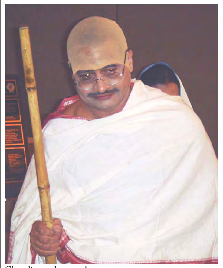
Ghandi was there too!